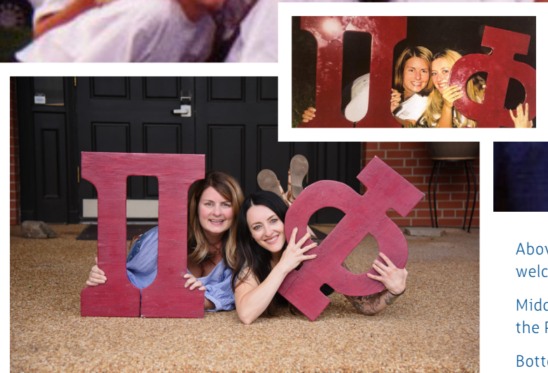
Above: Bid Day Fall 1998. The Fall 1997 New Member class welcomed the new Fall 1998 Pi Phis to Colorado Gamma!