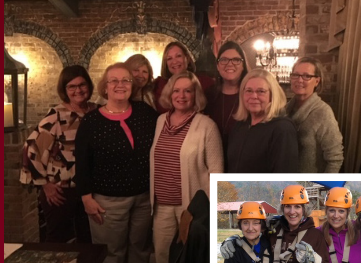
Above: Pi Phis across chapters and generations gather for dinner to celebrate their sisterhood.

Many opportunities exist where you can mentor individuals, advise chapters and shape the direction of the Fraternity. Offer your leadership skills and experiences while you engage in fun and friendship with Pi Phis across chapters and generations. Please visit www.pibetaphi.org/volunteernow to submit your interest. ◀